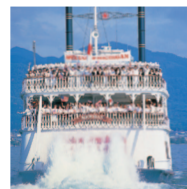
Michigan 80 & 60

On the "Sky Deck" of the Michigan with the fun crew