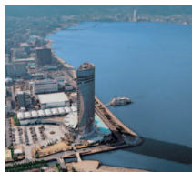
Niono-hama Sightseeing Port (Otsu Prince Hotel)