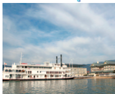
Yanagasaki Lakeside Park Port (Biwako Otsukan)